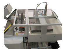
Optional bag deflator removes air in bag prior to sealing