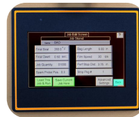
An easy to use interface is provided on a color touchscreen.