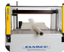
Open loading area for large products